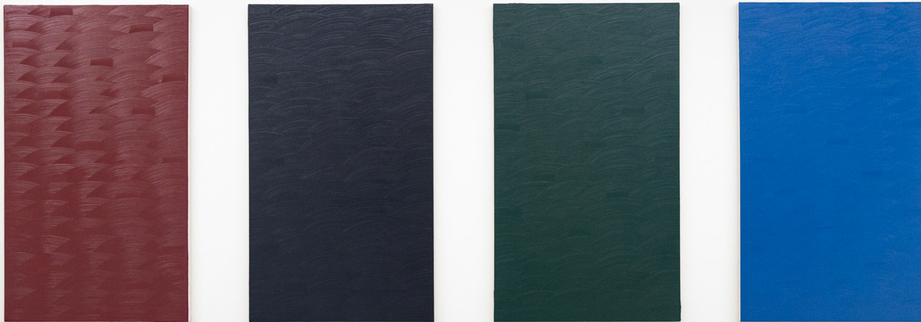
Jamie Te Heuheu The Melody of You (I - IV) , 2025 Oil on canvas, gamvar varnish Each work, 180.5h x 105.5w cm