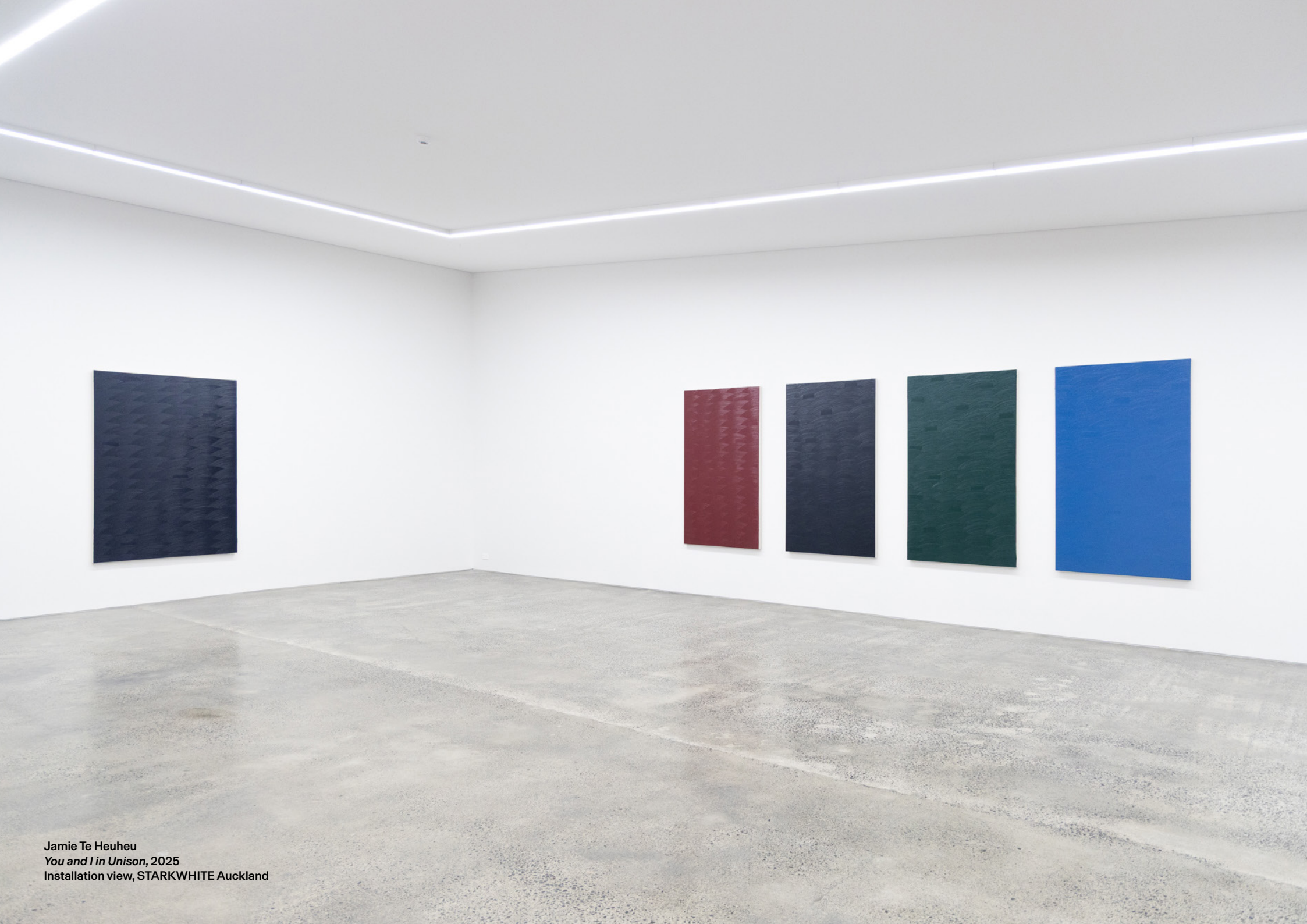
Jamie Te Heuheu You and I in Unison , 2025 Installation view, STARKWHITE Auckland