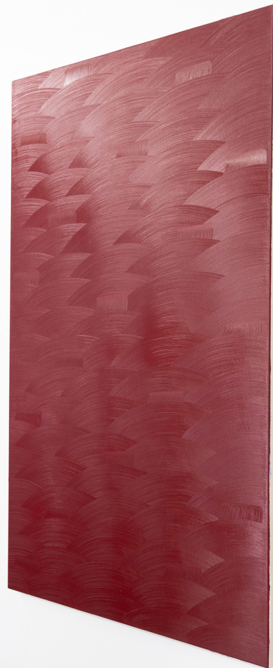
Jamie Te Heuheu The Melody of You (I) , 2025 Oil on canvas, gamvar varnish 180.50h x 105.5w cm NZD $18,000 incl. GST