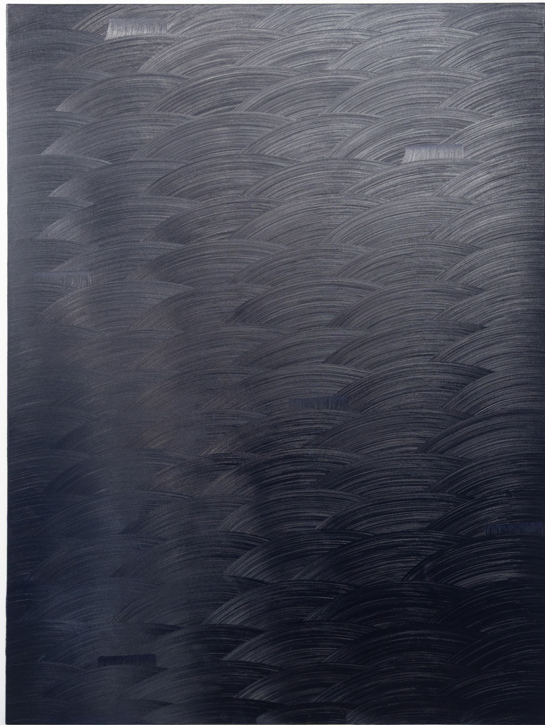
Jamie Te Heuheu Beyond the Sea , 2025 Oil on canvas, gamvar varnish 200h x 150w cm NZD $24,000 incl. GST