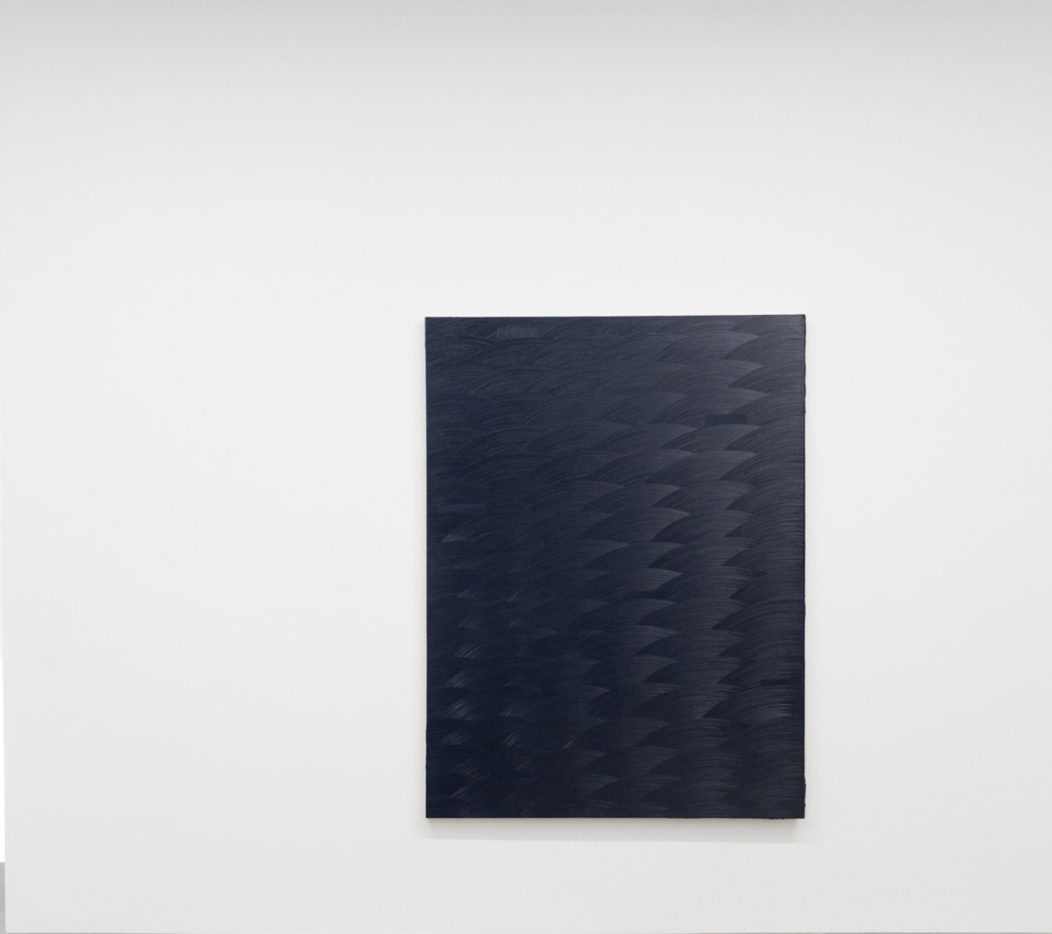
Jamie Te Heuheu You and I in Unison , 2025 Installation view, STARKWHITE Auckland