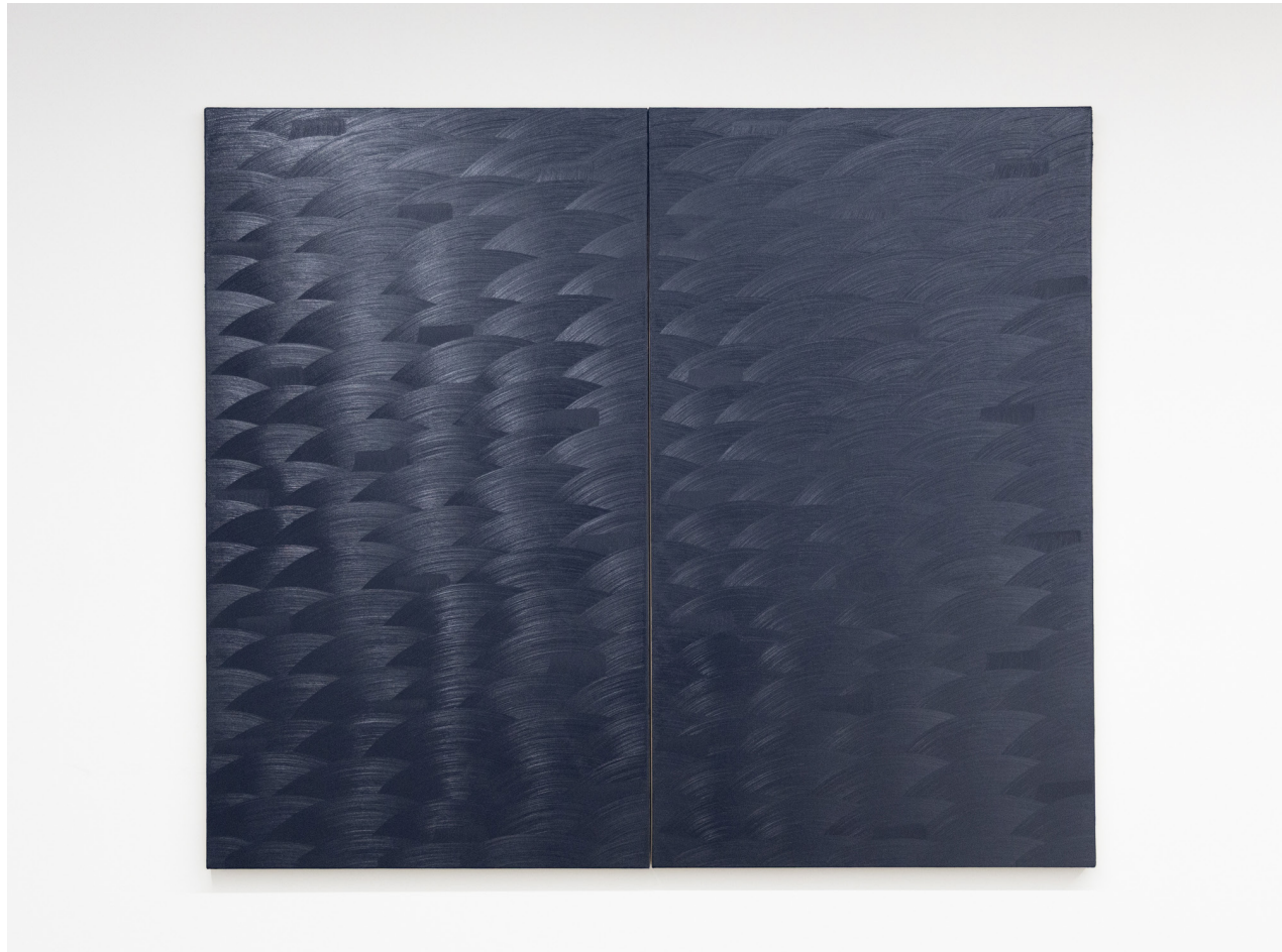
Jamie Te Heuheu You and I in Unison , 2025 Oil on canvas, gamvar varnish Diptych, each work 180.50h x 105.5w cm NZD $24,000 incl. GST