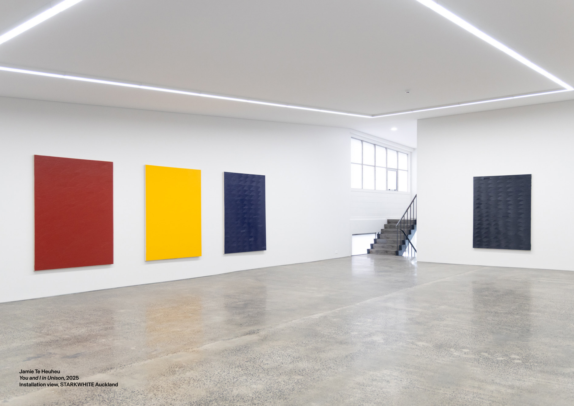
Jamie Te Heuheu You and I in Unison , 2025 Installation view, STARKWHITE Auckland